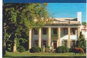
Belle Meade Plantation.