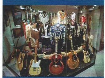
Country Music Hall of Fame.