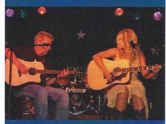
Nashville Nightlife Dinner Theater.